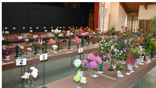
A hall full of floral splendour

We would welcome new exhibitors in every category to boost the interest for show visitors, so please don't be shy, give it a try. The dates for our shows in 2024 are as follows, and all the information and schedules can be found on our website, horshamhorticulturalsociety.co.uk .