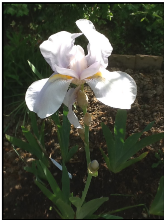
Geoffrey Kirk—Iris basking in the sun