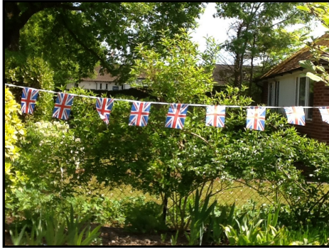
Geoffrey Kirk—Decorating the garden for VE day