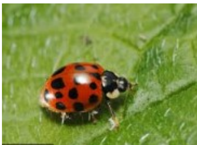
Our native ladybird

In the autumn people were constantly complaining that swarms of them were invading their houses. Apparently these bugs had to hibernate to escape our British winters or they would perish.