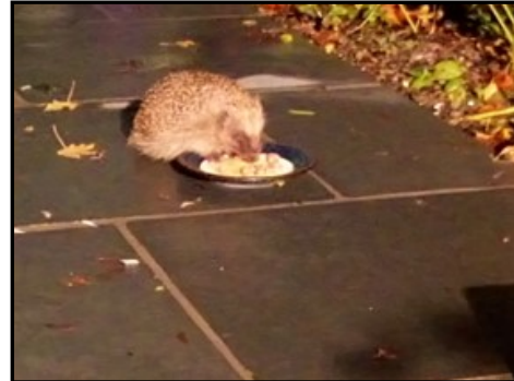
Lynda Cheeseman—a welcome garden visitor